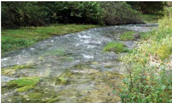
Trindle Spring in Cumberland County has a large amount of flow due to springs entering the stream from underground sources. It has a robust wild trout population.

All trout streams start small. Since they contain trout, the headwaters of trout stream watersheds normally have little pollution and are more likely to be forested. These small first and second order streams are usually tight and challenging to fish. In a well-connected watershed, they may act as nurseries for young wild trout to grow up and move down to lower reaches of the watershed. The coldest water and steepest sections of the gradient are likely to be found in the headwater reaches of a trout stream. In Pennsylvania, first and second order headwater streams are the best places to find wild brook trout. These streams can serve as thermal refuges for trout in the heat of summer. One of the greatest challenges in fishing these streams can be finding large enough pools to hold trout. Look for higher gradient reaches in freestone streams to have good trout holding water. These sections can have lots of rock and boulders that help form larger pools. Limestone streams can often produce nice-sized trout in their headwaters, though vegetation can be a challenge in the summer, so fish them early in the year. Often, there are few forage fish in headwater trout streams, though sculpins may be present. Carry a thermometer to find the coldest headwater tributaries of a trout stream to find good numbers of wild trout.