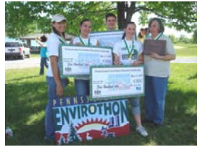
Second Place Future Hope Home Learners Snyder County