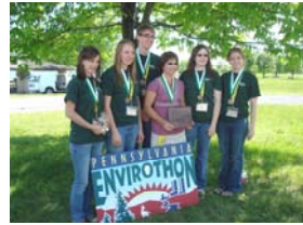
Third Place Warren Area High School Warren County

In 2009, more than 300 high-school students representing 65 counties participated in the twenty-sixth Pennsylvania Envirothon. The event was held at the Pennsylvania DCNR Bald Eagle State Park located in Howard on May 19.