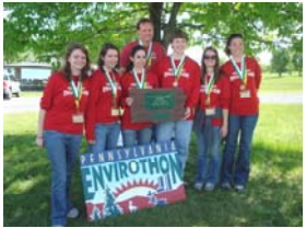
First Place Penncrest High School Delaware County