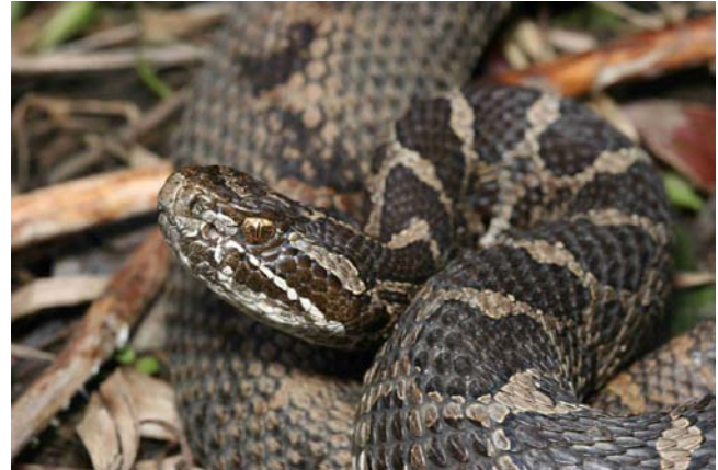
Figure 1. Eastern Massasauga ( Sistrurus catenatus ).

Taxonomy: Class Reptilia, Order Squamata (lizards and snakes), Family Viperidae (pit vipers), Eastern Massasauga ( Sistrurus catenatus catenatus ) (Figure 1.)