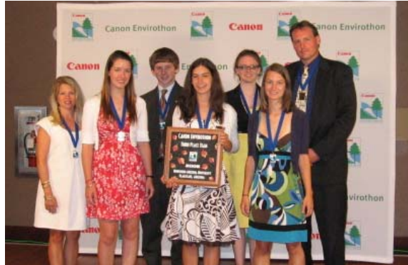
PA CANON ENVIROTHON TEAM

The first place Delaware team received a total of $25,000 in Canon scholarships along with Canon equipment for their advisor and sponsoring