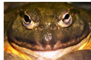
To protect biodiversity, we must protect natural habitats.

The term "biodiversity" is indeed commonly used to describe the number, variety, and variability of living organisms.