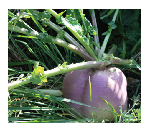
Turnip (above) and forage radish (below) cover crops provide a lot of above and below ground biomass; and their "bio-drilling" action penetrates compacted layers to improve soil health.

The High Plains subregion of the Great Plains is characterized as semiarid, shortgrass prairie. Extreme temperature changes and high winds characteristic of the area can have drastic and devastating effects on exposed soil. In the High Plains, more than 65% of the soil must remain covered to limit evaporation of water. In this rainfall limited area (average rainfall is 10 - 20 inches), maintaining soil cover is an important management strategy for profitable agricultural production. Bare soil heats up quickly in direct sunlight; and the hotter it gets, the faster water evaporates from it. This not only wastes water, but leaves salts behind at the soil surface. Residue cover also limits the drying effect of the wind and traps snow during the winter.