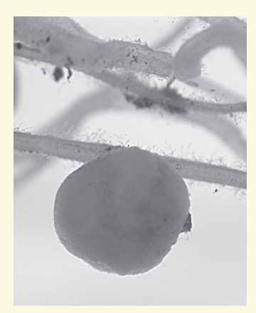
Rhizobia bacteria fix atmospheric nitrogen into ammonium after becoming established in root nodules of leguminous plants.

One of the many beneficial relationships between plants and soil organisms is the acquisition of nitrogen from the atmosphere by a variety of organisms, including bacteria (rhizobia) that live symbiotically with leguminous plants, such as beans, clover and vetch. When these organisms die, or the plants they associate with shed leaves, shoots, stems, or roots, this material becomes part of the soil along with the nitrogen it contains.